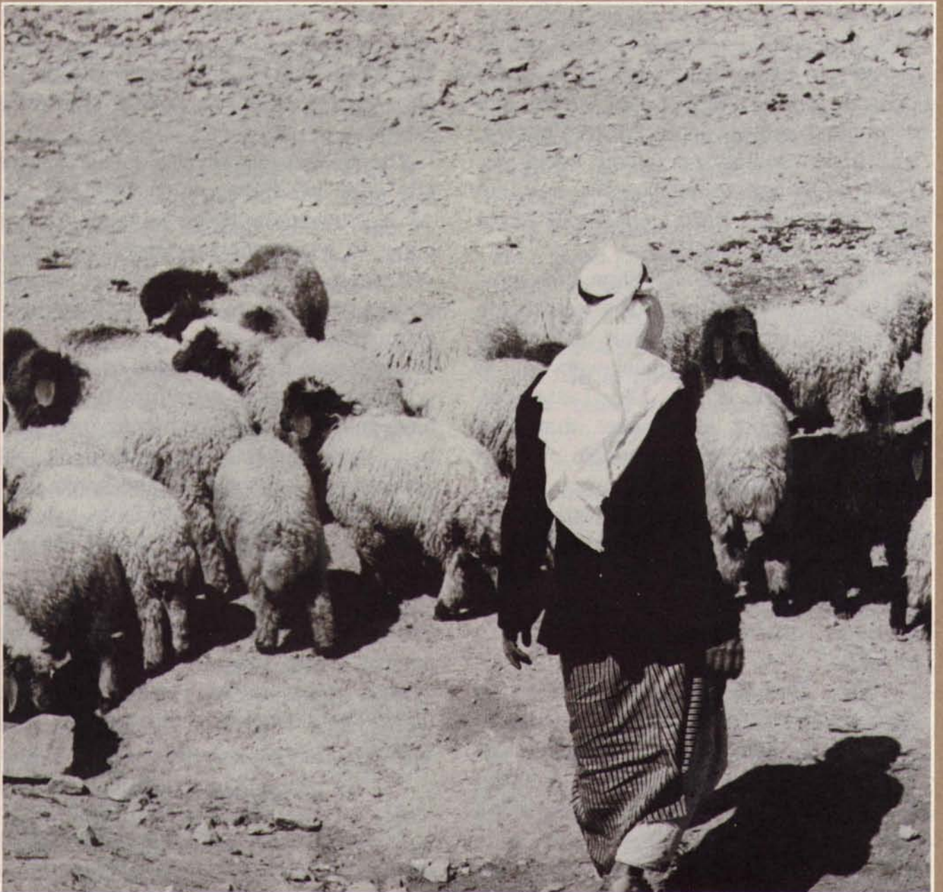
The Early Years