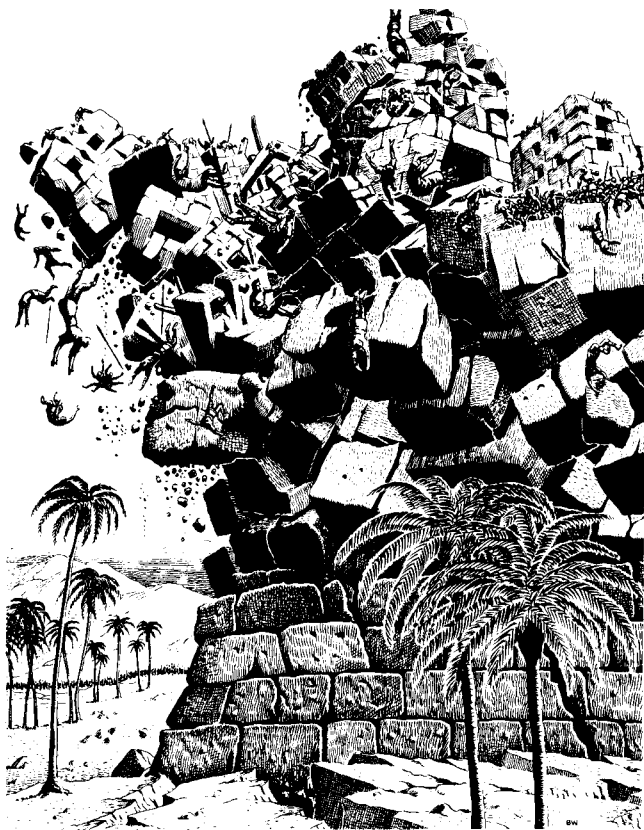
The walls of Jericho tumbling down at the final trumpet blast.