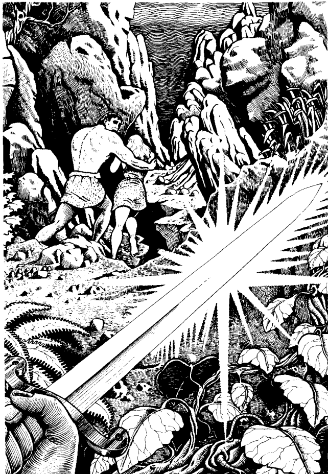
Adam and Eve being driven from the Garden of Eden for not obeying God.