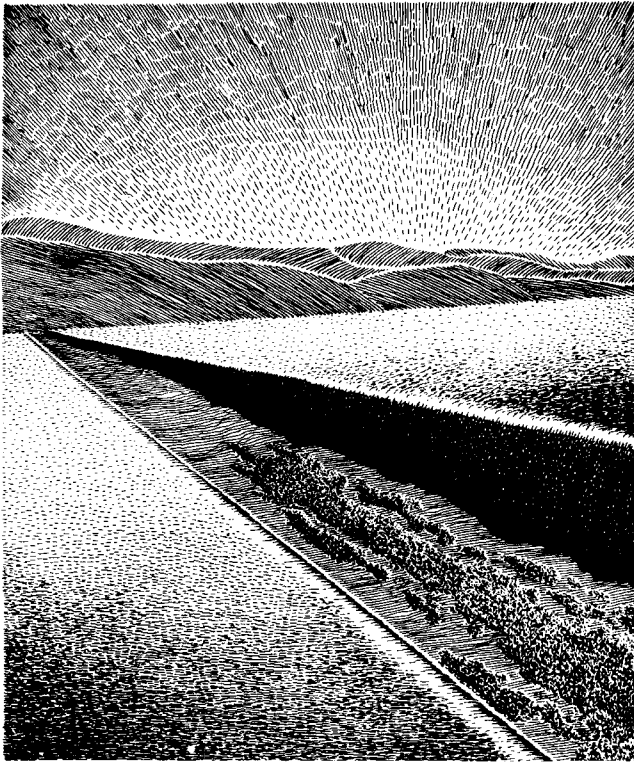
God opening the Red Sea, allowing the Israelites to escape.

God told Moses to go to Pharaoh and tell him to let the people of Israel go. But Pharaoh refused to let them go.